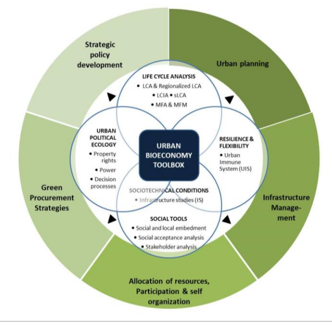
Figure 2. The proposed toolbox for addressing the management of the urban bioeconomy metabolism

Integrated approaches reflect on resource flows as much as on history, policy and socioeconomic conditions of urban contexts. They include considerations on resilience/resistance (for example in case of hazards) and on flexibility and multifunctionality of urban structures (Anderberg, 2012; Bristow & Mohareb, 2019). Structures of (civil) self-organization, power relations and decision processes allow more detailed perspectives on urban resource flows and access to them (Broto et al 2012; Bristow & Mohareb, 2019).