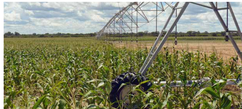
Large-scale irrigation systems in Namibia.

ried out whereby the seeds that would have otherwise been distributed over the entire surface, are sown individually in small pre-drilled holes, which are then fertilized with cow dung and covered with compost. »Whether or not this method of cultivation is successful, depends on just how committed the farmers are.« Preliminary results have shown clearly higher yields. However what has been successful in this region does not necessarily mean that it will be equally successful elsewhere i.e. in Botswana or Angola: »Whether this method of cultivation will be successful also depends very much on the commitment of the farmers themselves«, says Dr. Michael Pröpper. The anthropologist from the University of Hamburg is using case studies to investigate how the inhabitants of three selected municipalities use the natural resources along the Okavango. Technological changes in agriculture cannot easily be applied because the dissemination of information down to the level of the farmers is very slow: »Knowledge transfer from the authorities to subsistence farmers