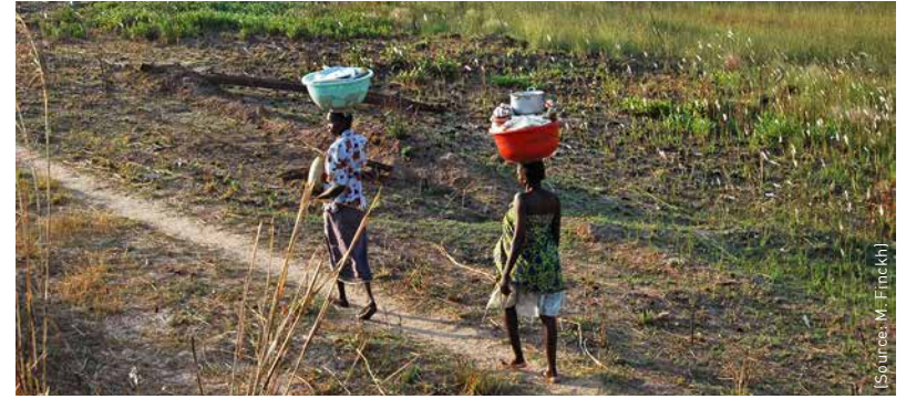
Local women in Cussequ, Angola.

Realising this goal for an area that covers some 430,000 square kilometres is no easy venture. Scientific data for the catchment area of the Okavango is still missing, particularly for Angola and therefore researchers still need to collect basic information – on agriculture for example. Soil scientists such as Dr. Alexander Gröngröft from the University of Hamburg are sometimes faced with unusual problems: »The amount of phosphorus is so small on most of the agricultural investigation sites that it cannot be detected using our conventional methods of analysis«, he comments. Such data is imperative however, since phosphorus interactions are essential as nutrients for agricultural crops. How can this vegetation grow with such a limited amount of nutrients? How does the nutrient cycle work when there are hardly any nutrients available? How can we intervene with the cycle to make the soil more fertile? These are just some of the questions that Gröngröft would like to find the answers to