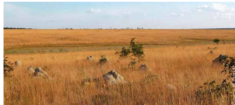
Grassland with termite hills, Angola.

■ The Future Okavango www.future-okavango.org