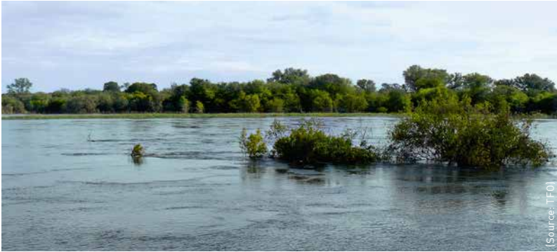
The Okavango, Namibia.