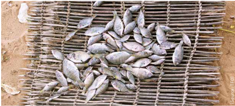
Typical catch using traditional fishing equipment, Namibia.

Furthermore, companies should be required to pay for the costs of using the services of nature. This would induce incentives for a more sustainable use of natural resources. In order to be able to compare different land-use forms, the scientists are developing bio-economic computer models.