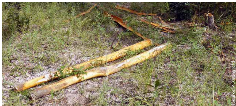
Illegally logged wood for building materials in Botswana.

Conservation Agriculture is the approach being adopted, with which they are hoping to harvest more corn or millet than previously on sandy and nutrient-poor soils. With this approach tests are being car-