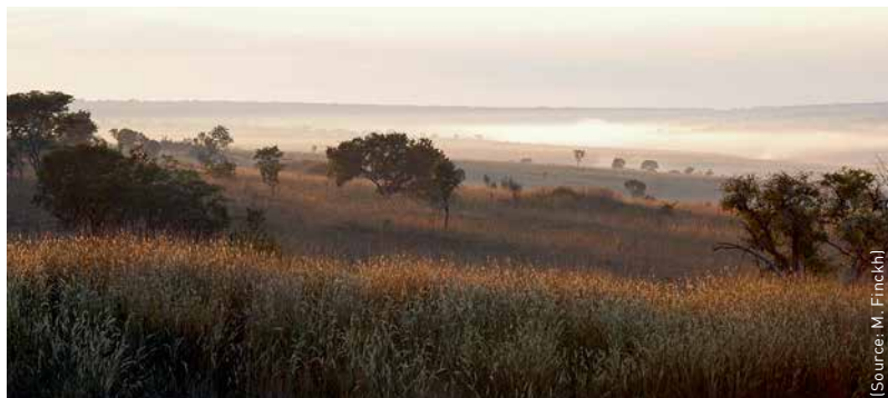
View of a valley close to Chitembo, Angola.

it illustrates the typical problems of Africa: population explosion, limited education, artificially-drawn borders from the colonial period, unfavourable predictions for climate change.«