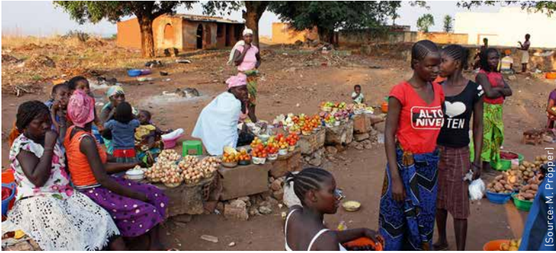
Local market close to Chitembo, Angola.

such as savannah forests for example are known to sequester a substantial amount of the world's carbon reserves.