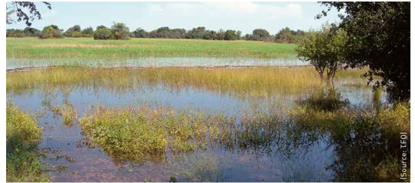
The Okavango delta, Botswana.