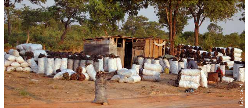
Charcoal for sale at the side of the road, Angola.

important life support system. For centuries they have been living off what nature has had to offer: they catch fish, grow crops, collect fibrous materials, firewood and building materials and use medicinal plants – all in harmony with nature. 500 bird species, 128 species of mammals as well as 150 species of reptiles and amphibians have so far been recorded