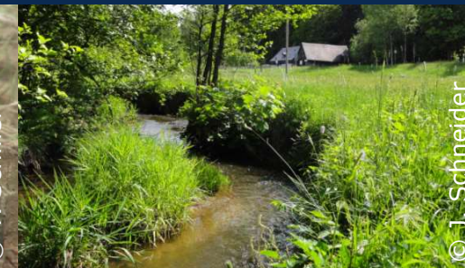
Running water (project region)

Gemeinsam gefördert durch das BMUB/BFN und BMBF: