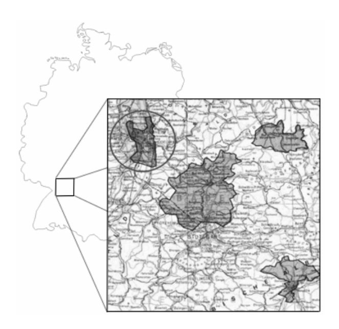
Figure 1. Spatial distribution of the common hamster in Baden-Württemberg in 1936 (grey areas) and 1995 (circled).

The Western-most populations of the common hamster are in Belgium, The Netherlands, and France, where the hamster has suffered severe population breakdowns and genetic impoverishment (Neumann et al., 2004). The German hamster populations are important contributors to the stock of common hamsters in Western Europe, because of their role as bridges to hamster populations in Eastern Europe and Asia (Neumann et al., 2005). In Germany, the regions that contain populations of the common hamster are Baden-Württemberg, Bavaria, Lower Saxony, Hesse, North Rhine-Westphalia and Saxony-Anhalt. Protection of the common hamster is now a serious consideration in spatial planning in these regions.