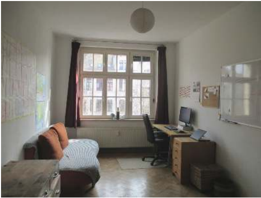
Large southward windows making room bright