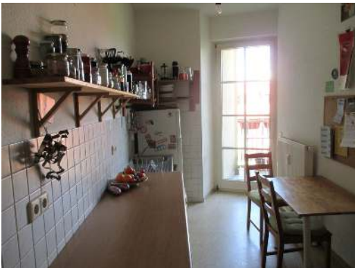
Kitchen with fridge, dish washer and balcony