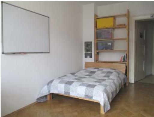
Opposite wall with door to corridor