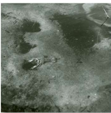
Preterm Ending II. 60 x 60 cm | 2019 Photograph u/Acrylic Glass (matt) Catalogue, p. 25