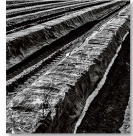
Cloaked II. 80 x 80 cm | 2013 Photograph u/Acrylic Glass (matt) Catalogue, p. 13