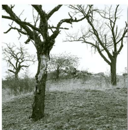
Spring. 80 x 80 cm | 2022 Photograph u/Acrylic Glass (matt) Catalogue, p. 7