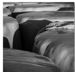
In the Field. 80 x 80 cm | 2018 Photograph u/Acrylic Glass (matt) Catalogue, p. 17