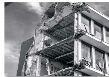
Loss. 80 x 111 cm | 2018 Photograph u/Acrylic Glass (matt) Catalogue, p. 26, 27