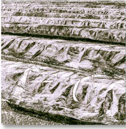
Cloaked I. 80 x 80 cm | 2017 Photograph u/Acrylic Glass (matt) Catalogue, p. 11