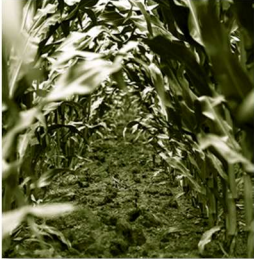
Maize Tunnel. 80 x 80 cm | 2017 Photograph u/Acrylic Glass (matt) Catalogue, p. 15