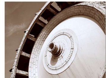
Coal Mining. 2022 Photograph Catalogue only, p. 31

If you are interested in one of my artworks (be it in the exhibition, be it in the catalogue) please do not hesitate to contact me. I am looking forward to hearing from you.