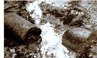
Leakage. 60 x 95 cm | 2017 Photograph u/Acrylic Glass (matt) Catalogue, p. 20, 21