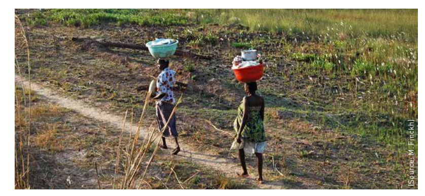
Local women in Cusseque, Angola.

Realising this goal for an area that covers some 430,000 square kilometres is no easy venture. Scientific data for the catchment area of the Okavango is still missing, particularly for Angola and therefore researchers still need to collect basic information on agriculture for example. Soil scientists such as Dr. Alexander Gröngröft from the University of Hamburg are sometimes faced with unusual problems: »The amount of phosphorus is so small on most of the agricultural investigation sites that it cannot be detected using our conventional methods of analysis«, he comments. Such data is imperative however, since phosphorus interactions are essential as nutrients for agricultural crops. How can this vegetation grow with such a limited amount of nutrients? How does the nutrient cycle work when there are hardly any nutrients available? How can we intervene with the cycle to make the soil more fertile? These are just some of the questions that Gröngröft would like to find the answers to