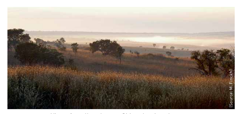
View of a valley close to Chitembo, Angola.

it illustrates the typical problems of Africa: population explosion, limited education, artificially-drawn borders from the colonial period, unfavourable predictions for climate change.«