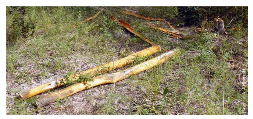
Illegally logged wood for building materials in Botswana.

Conservation Agriculture is the approach being adopted, with which they are hoping to harvest more corn or millet than previously on sandy and nutrient-poor soils. With this approach tests are being car-