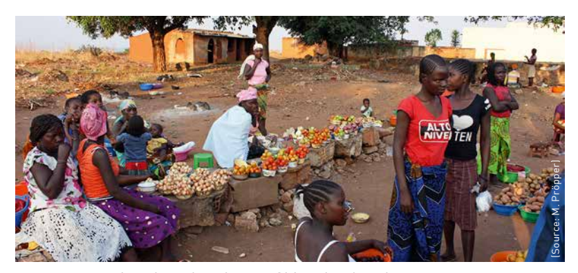
Local market close to Chitembo, Angola.

such as savannah forests for example are known to sequester a substantial amount of the world's carbon reserves.