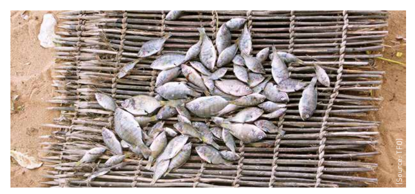
Typical catch using traditional fishing equipment, Namibia.

Furthermore, companies should be required to pay for the costs of using the services of nature. This would induce incentives for a more sustainable use of natural resources. In order to be able to compare different land-use forms, the scientists are developing bio-economic computer models. In this way we are able to see which conflicting goals arise among land users for food production and environmental protection like for example soil quality, states Dr. Stephanie Domptail, agro-economist from the University of Gießen. The monetary value for ecosystem services like for example the consumption of water by food producers can by all means be worked out.