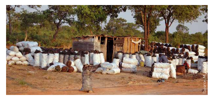
Charcoal for sale at the side of the road, Angola.

important life support system. For centuries they have been living off what nature has had to offer: they catch fish, grow crops, collect fibrous materials, firewood and building materials and use medicinal plants – all in harmony with nature. 500 bird species, 128 species of mammals as well as 150 species of reptiles and amphibians have so far been recorded