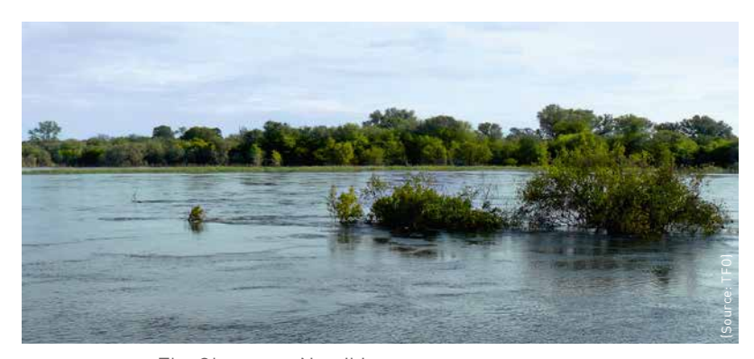
The Okavango, Namibia.

■ The Okavango ranks among the longest rivers in southern Africa and its volumes of water are imperative for the existence of many people. Overexploitation and privatisation are however threatening this fragile ecosystem. German researchers are in the process of trying to prevent this from happening. They are implementing their expertise locally by providing models for alternative uses.