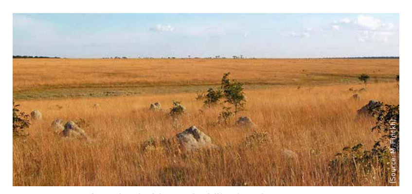
Grassland with termite hills, Angola.